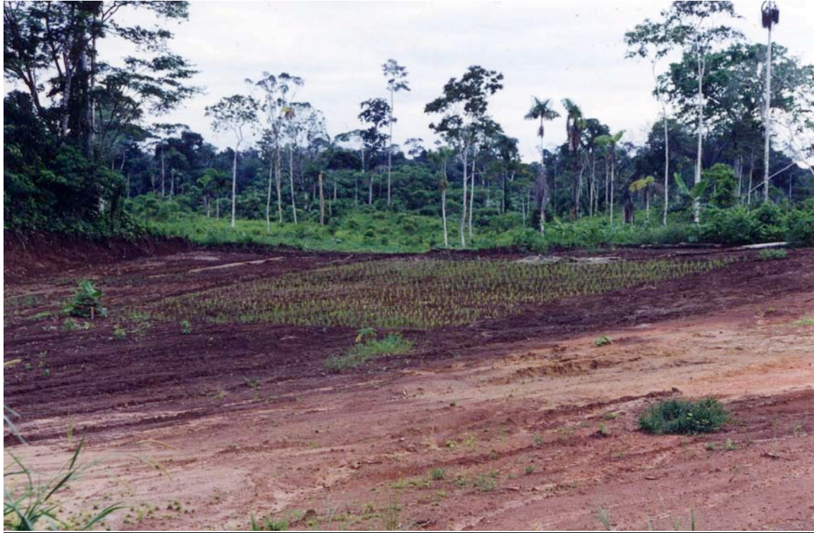
Fig.3 Amazonia, demonstrating the erosion of living biomass; from the mature forest in background to the exposed mineral soils in foreground

This perspective of a forest as a process, as well as the fact that, in terms of the biodiversity of a forest, trees account for 1% of a forest's biodiversity or less, suggests that the inclusion of a non-crop biodiversity and a greater quantity of vegetation within the armature of established plantations could become a lucrative venture for plantation and woodlot owners.