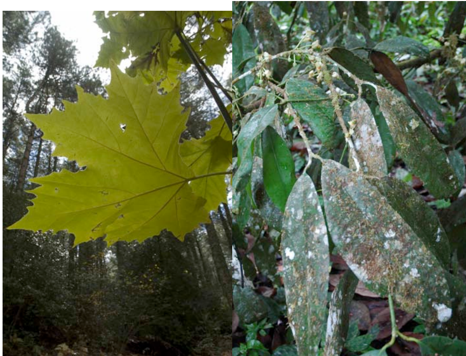
Fig2. Two types of leaves with different life strategies. Deciduous and Evergreen

conditions' Conversely, Small leaf size may confer drought resistance to early successional trees in drier environments and may be more effective in dissipation of heat by convection,