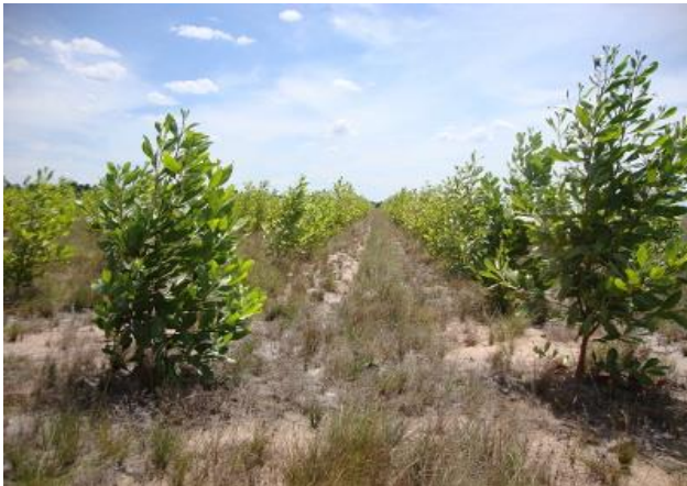
Tree plantation in sandy, acidic soil in the tropics.

Tropical forests are the lungs of our planet. 95% of all tree-based carbon sequestration occurs in the tropics, primarily between both 15° northern and 15° southern latitudes from the equator. The huge forests of Canada, Russia and Scandinavia and other temperate zones only account for 5% of tree-based carbon capture. This means that the decline of tropical forests is a huge cause of climate change. Many studies show that tropical deforestation emits greenhouse gases (GHG) and may well be the leading cause of desertification of the Earth. All trees play important roles in removing CO 2 from the atmosphere, but also other dangerous contaminants. They help hold ground water and thanks to the process of transpiration are crucial for cloud seeding and the maintenance of global rainfall patterns. Needless to say, forests also account for 90% of terrestrial biodiversity, making them essential habitats for life on our planet.