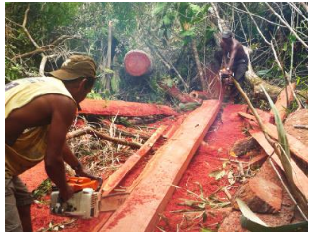
Deforestation in the tropics has climate change implications for the whole planet.

However, planting trees, especially tropical trees, involves more than just sticking a seedling in the ground. Tropical soils are often poor and acidic, in large part due to millennia of torrential rains that have leached the nutrients and organic material out of the soil, a process called lixiviation. For example, the grasslands of eastern Colombia ( llanos orientales ) and Venezuela have soils that are mainly composed of sand, ferrous oxide gravels and some clay. Similar conditions exist in large parts of Brazil and in the Amazon basin. This is why Amazon deforestation is such a huge problem: poor people cut down trees to grow subsistence crops, collect one harvest and then find that the soil is depleted, so they repeat the process, cutting down more rainforest. Unfortunately, this is the definition of insanity, doing the same thing over and over again, expecting different results each time.